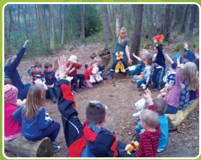
If you go down to the woods today!