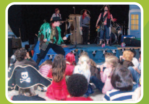
Shows and productions

We are always looking for innovative ways of extending the range of opportunities available to our pupils.