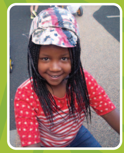
Friendship in the playground